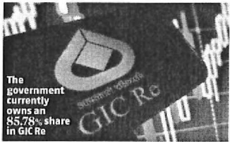
The government currently owns an 85.78% share in GIC Re

The Union Ministry of Finance will dilute a 6.78 per cent stake in public-sector reinsurance company General Insurance Corporation of India (GIC Re) to garner around ₹4,700 crore.